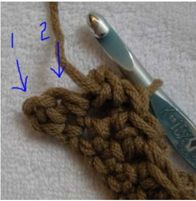
Single crochet in the final two stitches.