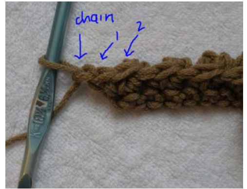
Chain 1 at the end of each row and turn your work over to begin Row 3.

ROW 3: Place a single crochet in the 3rd stitch from hook and continue single crochets in each stitch to end.