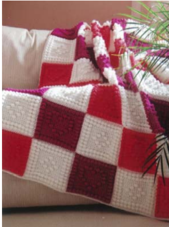
PATTERN AND INSTRUCTIONS ONLY Finished size is approximately 48" x 62"