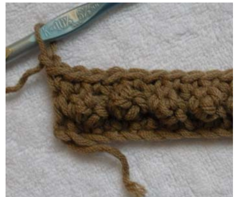
Chain 1, then turn and continue . . . until done.